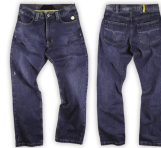
J2 JEANS (RELAXED FT) Blue