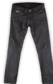
SILHOUETTE JEANS (SLIM FT) Black