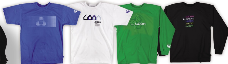
SPEED TEE Blue, Mint