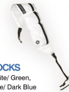
SOCKS White/ Green, Blue/ Dark Blue