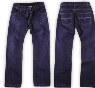
J1 JEANS (REGULAR FT) Dark Blue, Blue