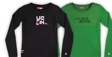
FLOWER LS Black