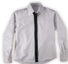
CONTRAST SHIRT White, Black