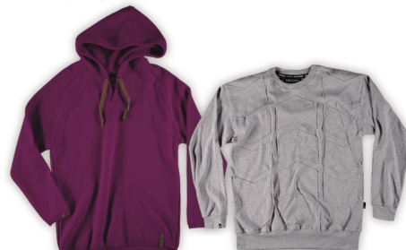
THE VAGABOND Purple, Mint