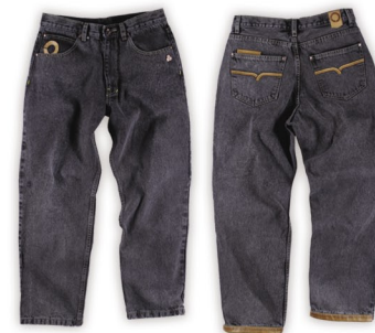
J3 JEANS (LOOSE FT) Black, Blue