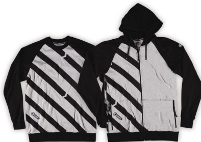
ARROW ST SWEATER & HOODED Grey/ Black, Grey/ Caribic Blue