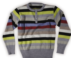
THE STRIPED JUMPER Rainbow