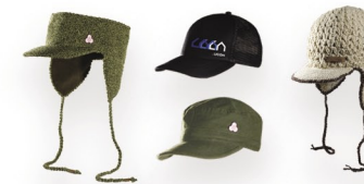
Visor Headband - Olive, Dark Brown Architecture Trucker - Black, White Rebel Cap - Black, Olive Wool Beanie - Sand